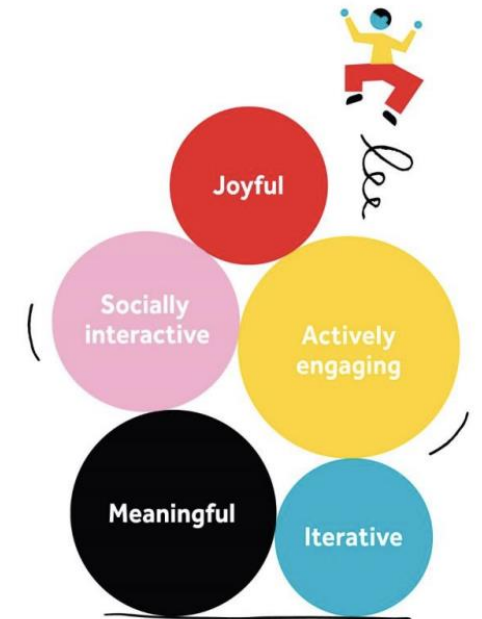
i5 Characteristics of Playful Learning